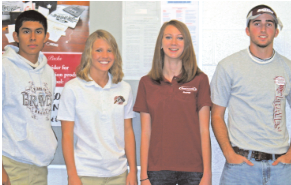
The Warcry staff members show off just a few of the styles available in the school store.

Respect Jesus, Respect Others, and Respect Yourself. We always teach the kids if you have those things in