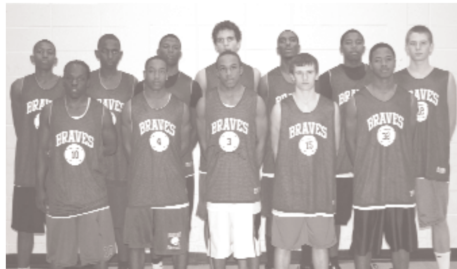
2008-2009 Boys Basketball Team finished 20 and 6.

Braves lost four out of their final seven games after beginning the season with only one loss in their first eighteen games.